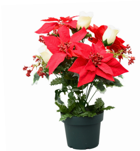
Type AA – $35.00

The Fall and Winter decoration ordering process is now being handled by cemetery employees based in our central office in Hillside, IL. Decoration orders for all of the cemeteries listed below should be mailed to: